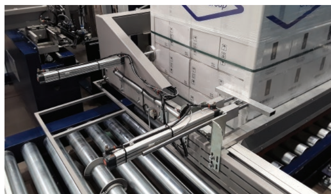
Corners protection device