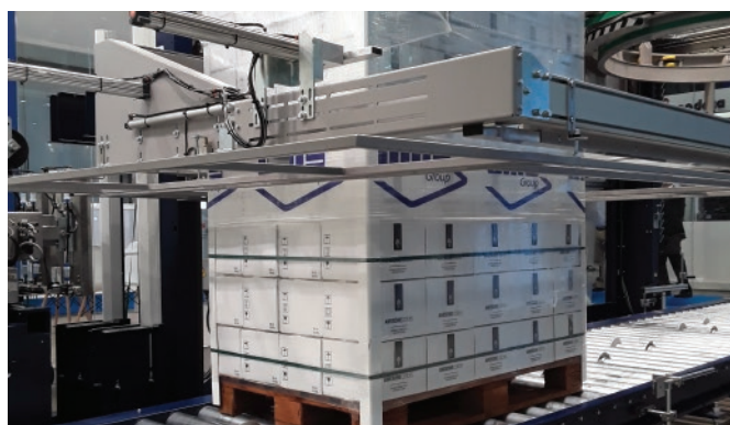
Strapping arch detail